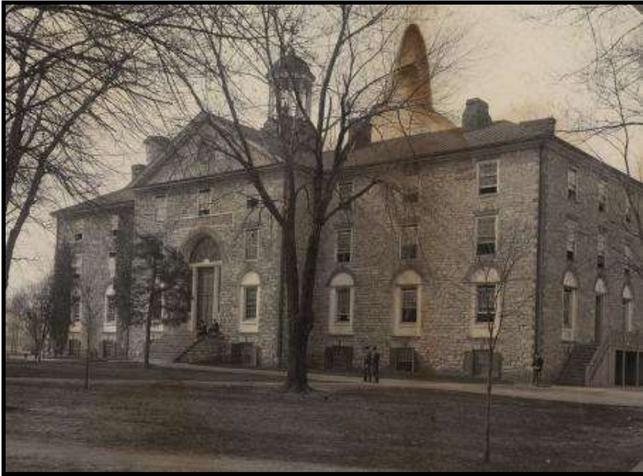
Old West, 1900

Copyright © 2015 Archives & Special Collections at Dickinson College