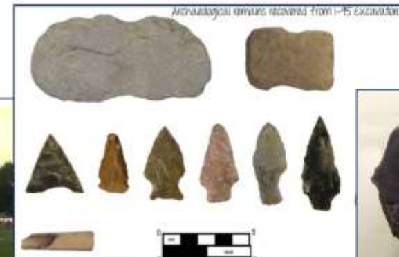
Archaeological remains recovered from I-95 excavations

Check it out at: https://vimeo.com/15855041