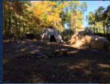
Meadowcroft Rockshelter (Avella)