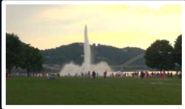
Deeply Buried Alluvial Deposits