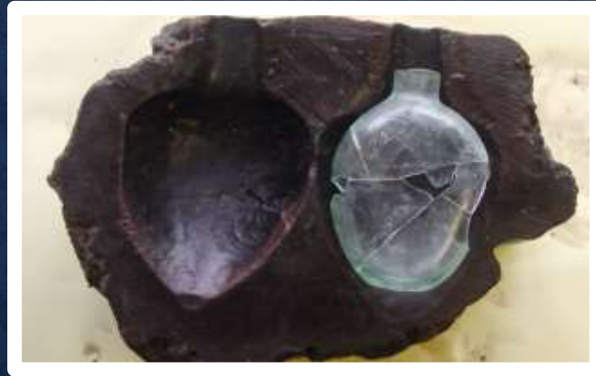
Deeply Buried Urban Contexts