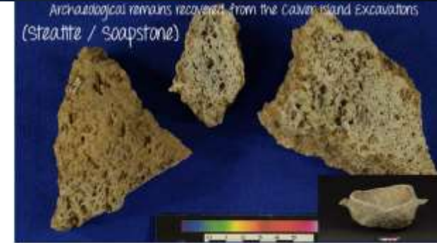
Archaeological remains recovered from the Calver Island Excavations (Steatite / Soapstone)