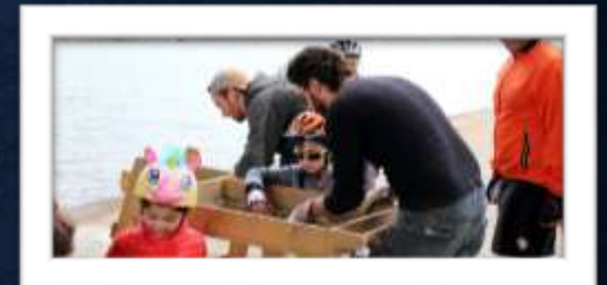
Are We Reaching the Public?

Rising Interest in Preservation Planning