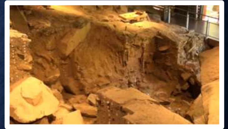
Deeply Buried Contexts Below Previous Thought