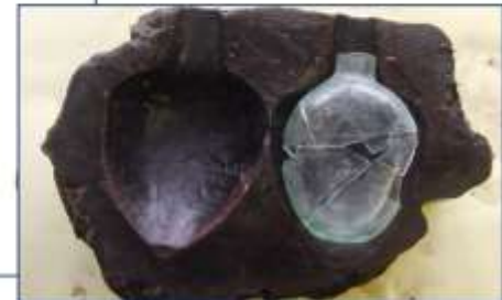
I-95 Excavations (Philadelphia)