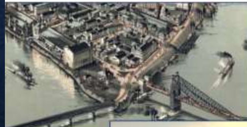
Forks of the Ohio Point State Park (Pittsburgh)